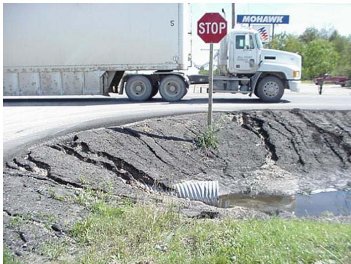
Soil erosion is a leading cause of water pollution.